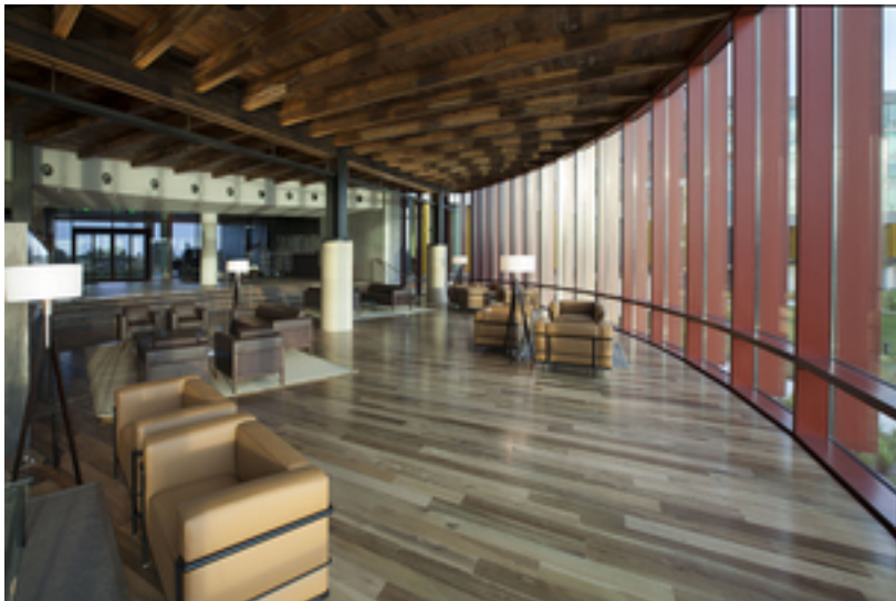
Leaf lobby with reclaimed oak floor and ceiling