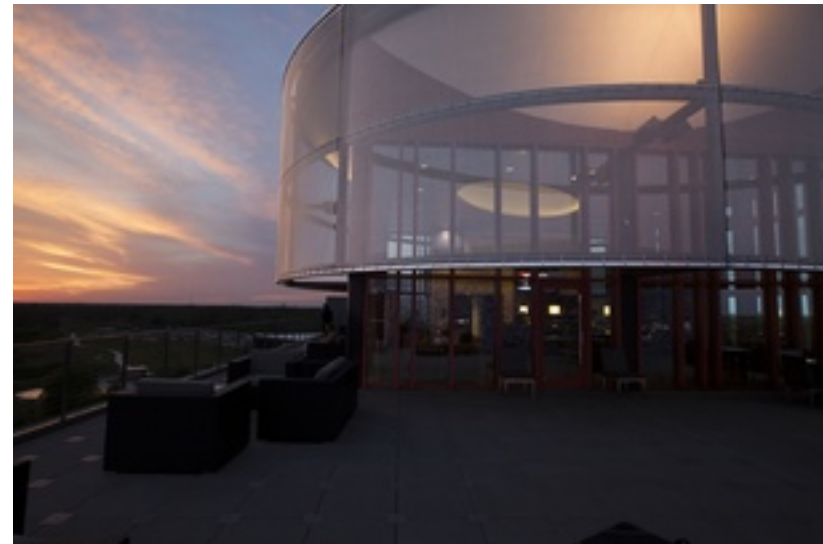
Fragmentary Blue custom heat scrim

For high res images, interviews and more information, please contact: JoAnn Locktov