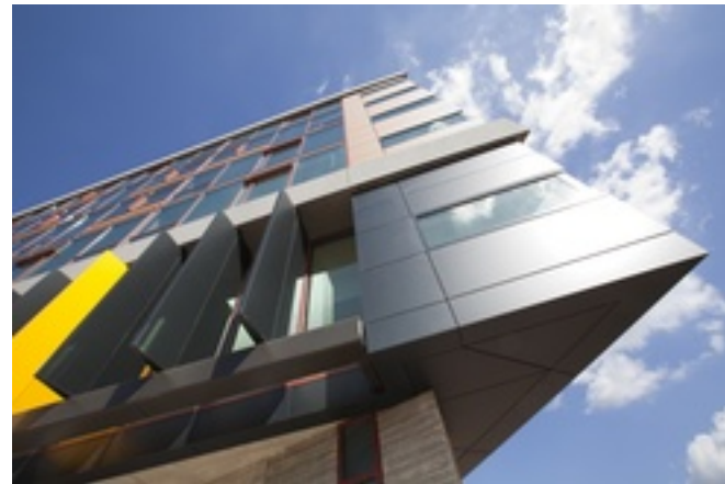
Brise soleil and corner detail