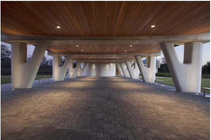
West facade.

(/images/CmsPageElementImage/88/61/58/53ea58e2d6a44a0d8b073bd80ab56b19/53ea58e2d6a44a0d8b073bd80ab56b19.jpg)