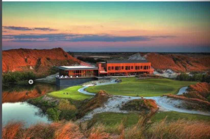
Streamsong Clubhouse viewed from the west.