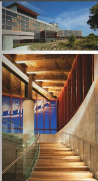
Top, left: west facade of Streamsong Lodge showing exterior view of the Leaf Lobby as it projects out over the landscape. Bottom, left: main stair in the Leaf Lobby. Top, right: Guest room and bottom, right: Leaf Lobby toward the main entrance.

The design could represent a cross-section of the site, with roots below the surface, the lake's edge above and the tree canopy in the sky. The architect explained that the lodge's rooms "become the canopy and the rooftop embraces the horizons and the night sky. The building is